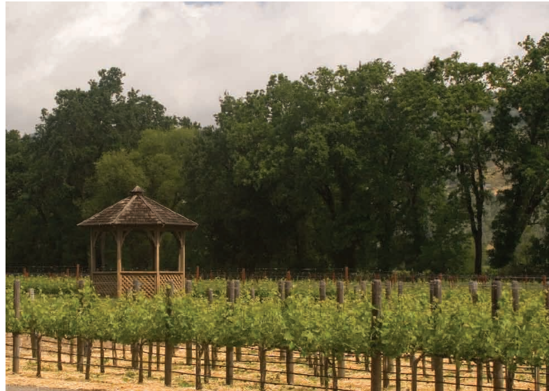
Facing Page: In the rocky soil of the ancient riverbed, the Tudals have grown Cabernet grapes for more than 30 years.